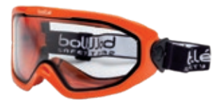
1669211 • Orange Frame with SBR Foam / Clear Duo Lens / No vents / No Notch / Fully Foam Seal