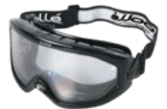
1650708 • Charcoal Frame with SBR Foam / Clear Duo Lens / Clear Mouth Guard / No vents / No Notch / Fully Foam Seal